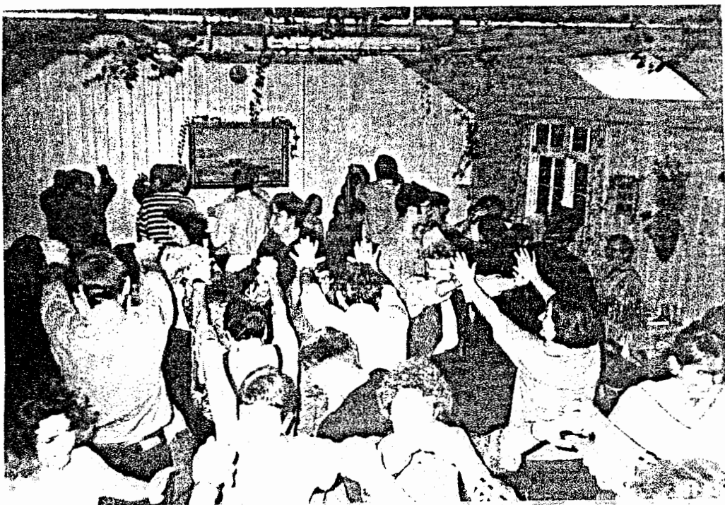
Barn Dancers Swinging One's Partners